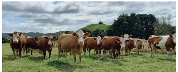
Cows at Beefit Simmentals