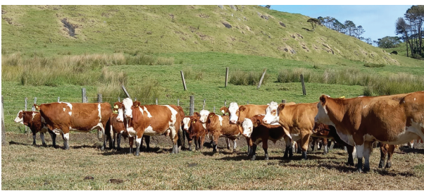
Cows and calves at Owkata Simmentals