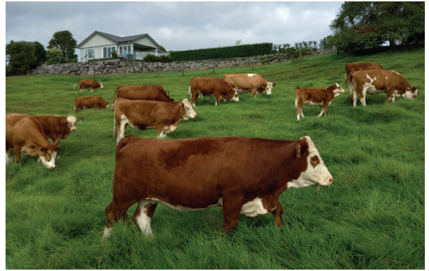
Cows with calves at Blackbridge