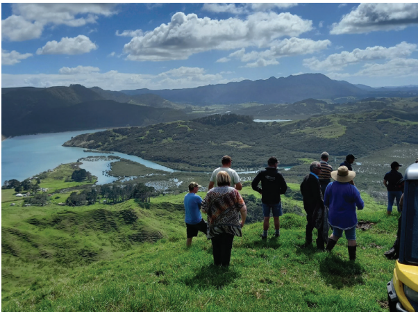
The view from the side of the hill – a long way up at Owkata