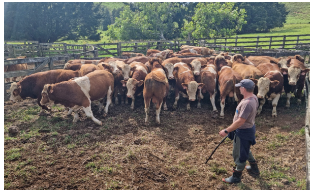
R2 Bulls at Beefit