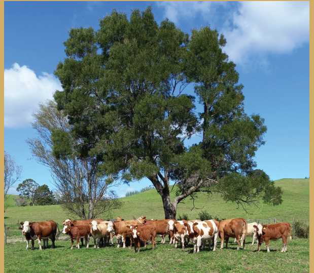
Cows and calves at Kaingaroa