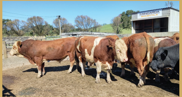
A selection of R2 bulls at Kaingaroa