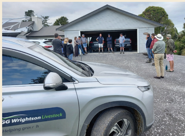
Morning greetings at Blackbridge Simmentals

Wednesday 23rd back on the bus, we travelled to Mt Camel Farms, Houhora. This is a large family-run crossbreeding operation of 1918ha, one third in grass. Running approx. 450 breeding cows, the vast majority of progeny are sold store as yearlings in the Houhora Spring Fair in September. They use Simmental bulls over their base herd, which converted from Hereford in the 1980's. Originally Red Devon bulls were used over the Simm X cows but now only Simmental are used. It was amazing to drive over some of the property in the bus, right next to the Pacific Ocean. With a mixture of rock, clay, peat and sand, along with fresh and salt water, it is a very diverse property which also includes a 7-8 ha watermelon crop each year grown by a local grower. As they need a new site each year, each old site is regressed. We were very privileged to be invited to this property and learn the clever management of its unique setting and challenges, and how Simmental play such a big part in it. Finally it was time for a team photo and the trip back to Kerikeri, with some of us getting chucked out at the airport on the way. Another great trip, great cattle and great people, our many thanks to the Northland breeders who took part.