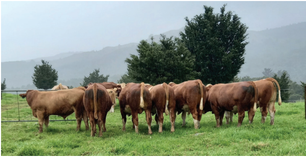
It was wet at Caniwi but the cattle (above and below) still put their best side forward