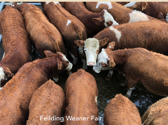
Feilding Weaner Fair