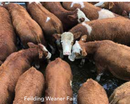
Feilding Weaner Fair.