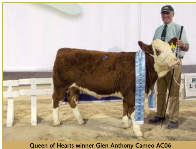
Queen of Hearts winner Glen Anthony Cameo AC06