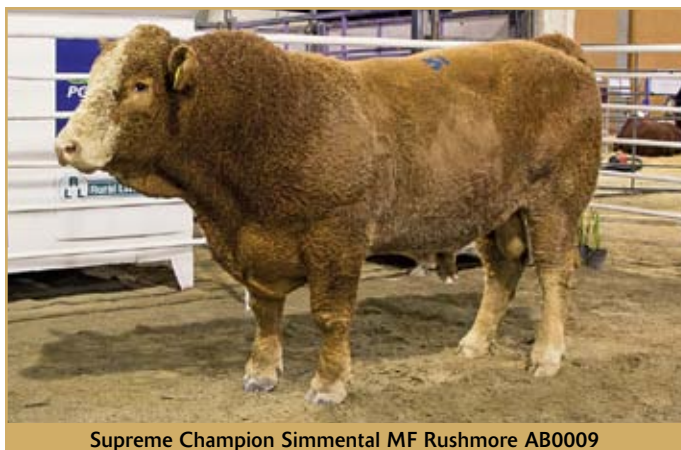
Supreme Champion Simmental MF Rushmore AB0009

On behalf of the vendors, SNZ would like to thank the many people who supported the sales at Beef Expo, both by purchasing and underbidding. Your support is always appreciated, and we wish you well with your purchases.