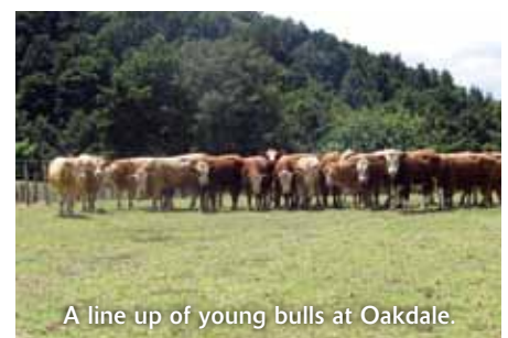
A line up of young bulls at Oakdale.