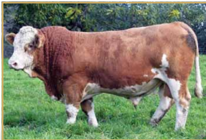
Highest priced bull MF Wow Factor

The Simmental bulls had a strong sale at the Aginnovation Beef Expo. All eight lots (3 x 2yr bulls & 5 x 1yr bulls) on offer were sold with an average price just short of $6000. The highest priced bull was MF Wow Factor, purchased by John & Helen Hammond of Ruaview Simmentals at Ohakune.