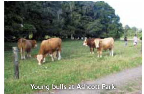
Young bulls at Ashcott Park.