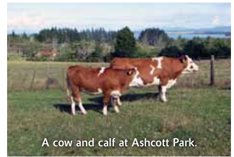
A cow and calf at Ashcott Park.