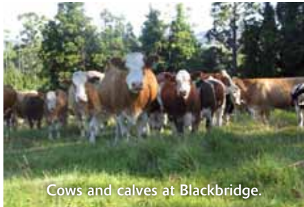
Cows and calves at Blackbridge.