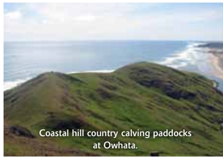
Coastal hill country calving paddocks at Owkata.

Before everyone starts getting caught up in the annual Christmas rush – yes the madness will be here before you know it – we have included some Simmental Northland Breed Tour highlights for you to enjoy.