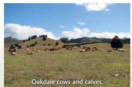
Oakdale cows and calves.