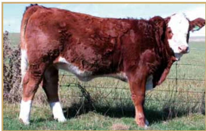
Top priced Simmental heifer Glenside Ariana