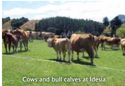
Cows and bull calves at Idesia.