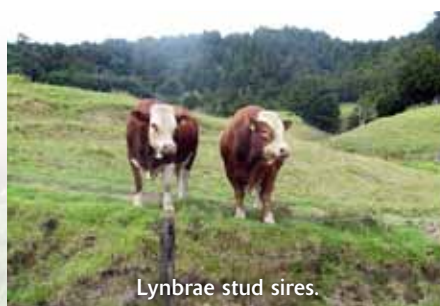
Lynbrae stud sires.