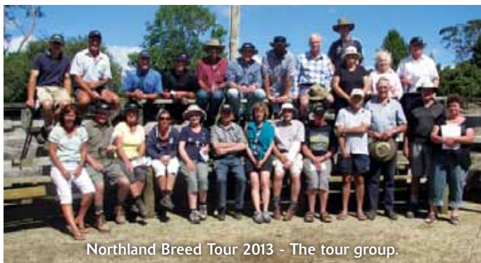
Northland Breed Tour 2013 - The tour group.