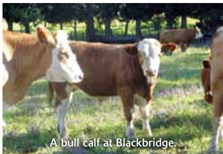
A bull calf at Blackbridge.